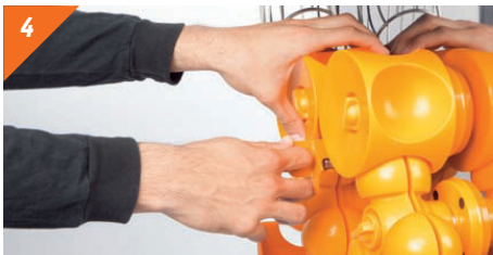
4 Extract the knife by pulling it towards you. CAUTION! The blade is very sharp, be careful not to cut yourself.