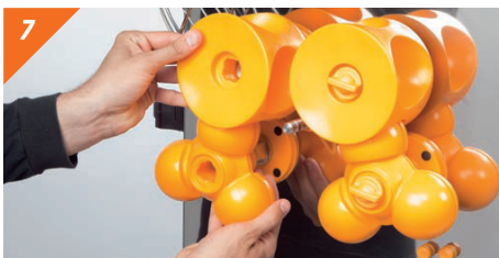
7 Take of the pressing units in pairs.