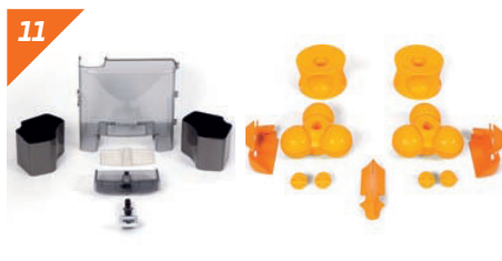
11 Replace the dismantled pieces by the cleaning kit pieces.