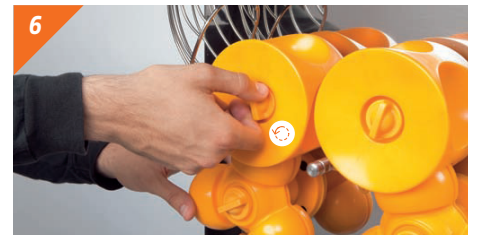
6 Unscrew the securing knobs of the pressing unit.