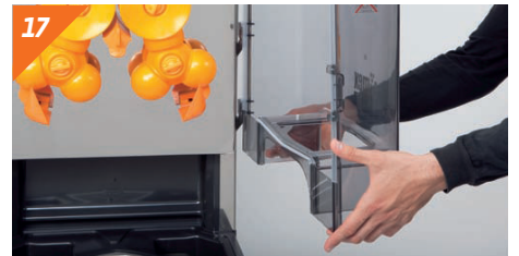
Put on the front cover.