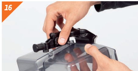
Mount the tap.