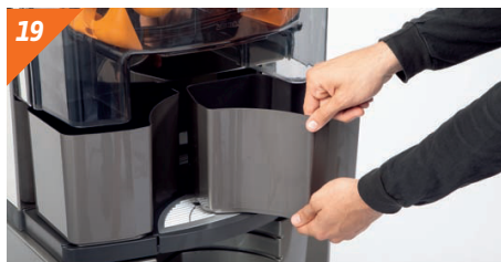
Place the peel buckets.