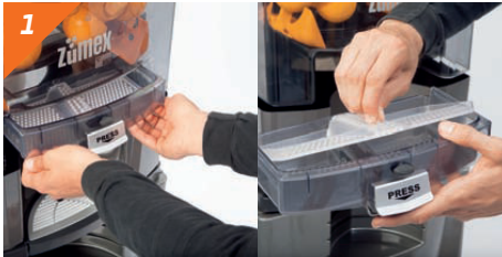
1 Take out the juice tray and the filter. Be careful not to lose the filter.

Caution! For a correct cleaning process please follow the instructions below. Make sure machine is unplugged from electrical current.