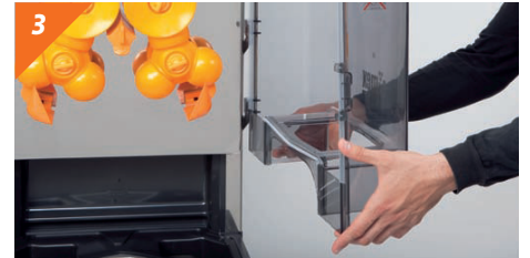
3 Take off the front cover.