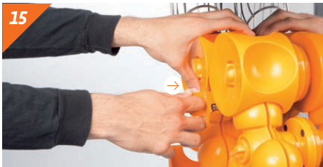
Put on the knife. Push until it clicks into place with a "click".