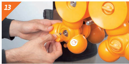
Fix the knobs and tighten them well. Missing knobs are to be replaced immediately. Never operate the machine with any knob missing.