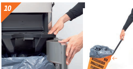
10 In case of podium models, clean the chute and the inside of the podium to remove all traces of peel and pulp.