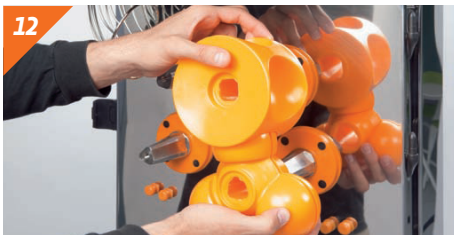
Mount the pressing units by pairs.

To assemble the machine repeat the process in reverse and ready to work.