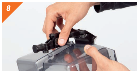
8 Remove the tap.