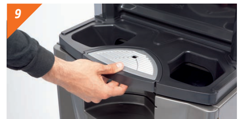
9 Take of the glass holder tray and the filter.