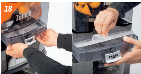
Insert the juice tray and the filter.