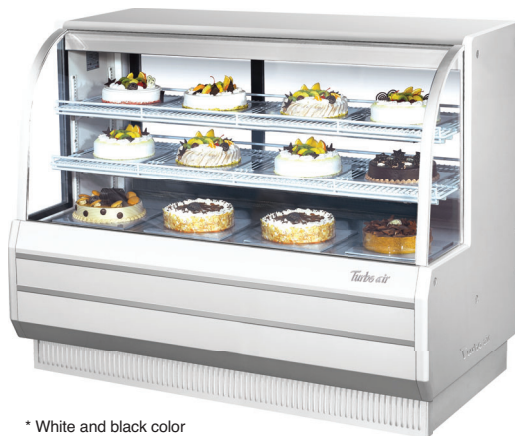
* White and black color come standard