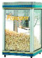
Model G8-Y (8 oz) & G12-Y (12 oz)