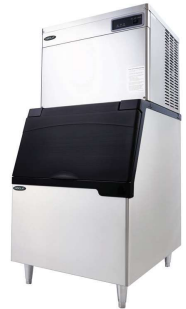
Bin KB-350 shown above is not included - sold separately