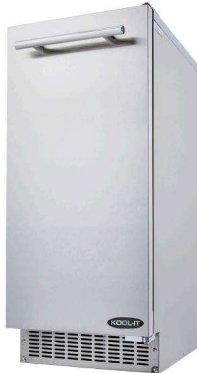
Bell/Gourmet Cube Dimension