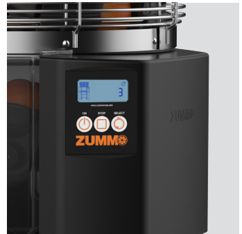
Higher juice extraction speed