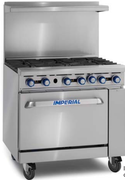
IR-6 shown with optional casters

OPEN BURNERS - PyroCentric™ 32,000 BTU (9 KW) anti-clogging burner with a 7,000 BTU/hr. (2 KW) low simmer feature. Cast iron PyroCentric burners are standard on all IR Series Ranges.