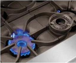
Two rings of flame for even cooking no matter the pan size.