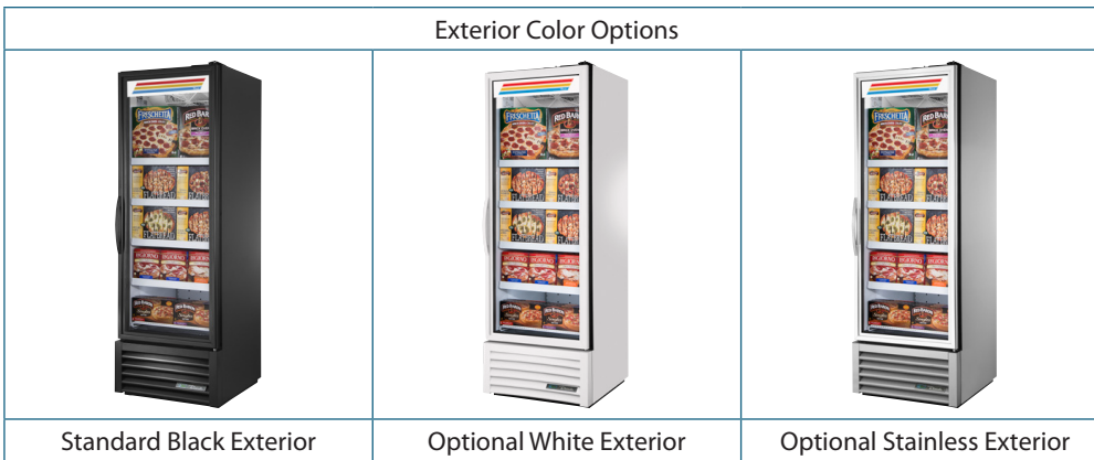
Standard Black Exterior