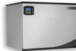
MIM650N / MIM650NH