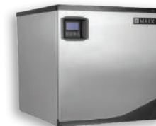
MIM360N / MIM360NH