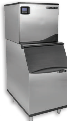
MIM360 ON MIB310N BIN