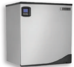
MIM1000N / MIM1000NH