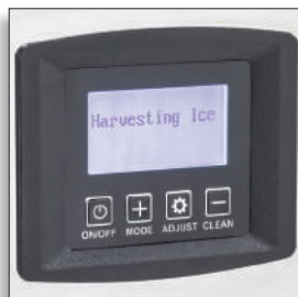
Digital Controller Display