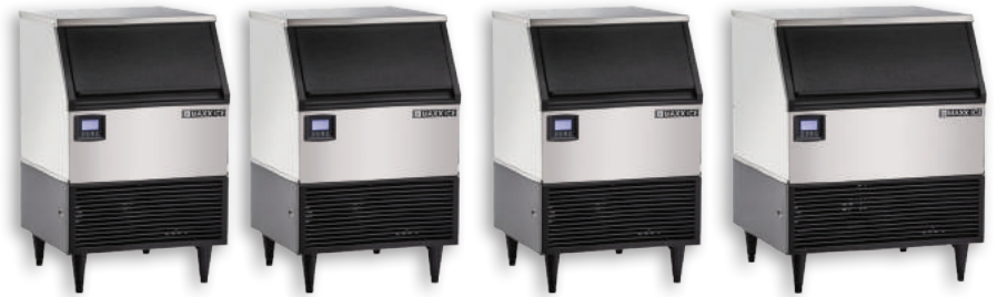
MIM150N / MIM150NH