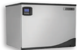
MIM370N / MIM370NH MIM500N / MIM500NH