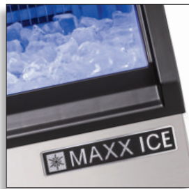
Self-Contained Ice Machine