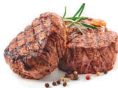
Slow Cooking / Grilling