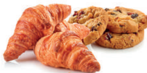
Pastry / Biscuit Cooking