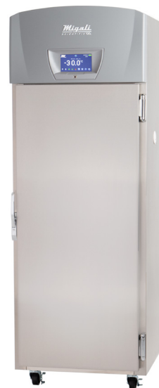
*Shown with optional IntelVU® Touch Screen Display

*Migali® IntelVU®: Touch Screen Microprocessor, 24/7 temperature monitoring, downloadable via USB port, full control over refrigerator performance with many additional features. See Migali® IntelVU® spec sheet.