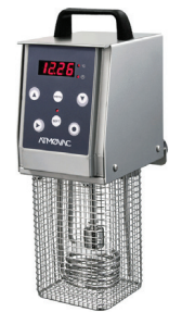
SOFTCOOKER 230 MADE IN ITALY