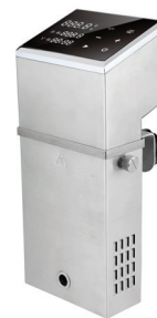
SV-310 MADE IN CHINA