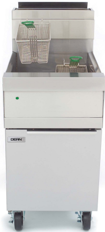
D160G Shown with optional casters.